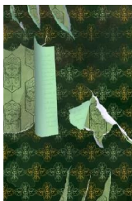
Digital simulation for the textile panel depicting the nobleman