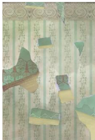
Digital simulation for the textile panel depicting the doctor