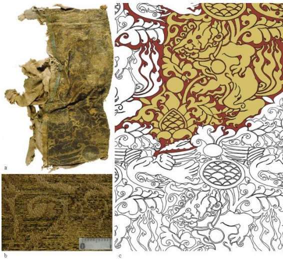
Figure 1 – “Lion” Lampas: a) Right cuffs; b) Detail; c) Graphical reconstruction/ Madalena Serro and Paula Monteiro.