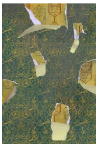
Digital simulation for the textile panel depicting the wallpaper designer