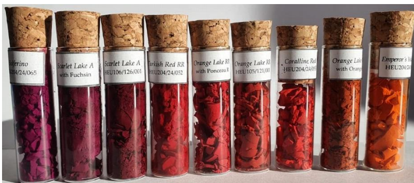
Figure 1: The nine red-orange lakes object of this study.

Reference paint layers were prepared, and their ageing and possible fading was monitored for six months by analysing two sets of paint model systems by colorimetry. One was exposed to indoor natural light, while the other was subjected to accelerated ageing in a Solar box. The composition in terms of organic colouring components and possible photo-degradation products was assessed by High Performance Liquid Chromatography with Diode Array UV-Vis (DAD), Fluorescence (FD), and High Resolution Mass Spectrometry (LC-HRMS) detection. The kinetics of fading of the different lakes were evaluated, and preliminary results on the stability of the formulations will be presented herein.