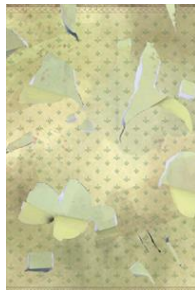
Digital simulation for the textile panel depicting the working-man