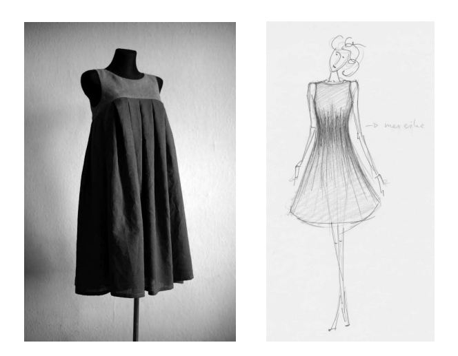
Fig 1, 2. Logwood dress (and project) designed by Laboratory of Natural Dyeing "Natural Art"

The Laboratory of Natural Dyeing "Natural Art" uses natural organic dyestuffs to support production of new non-toxic, non carcinogenic textile products with natural antibacterial and antimicrobial properties. The dyes obtained from logwood comes from heartwood. Tree have an inspiring range of medicinal uses with potential antioxidant, anticancer and antifungal activities so textile products with logwood has also huge potential application of the compounds found in logwood tree in various fields of science economy.