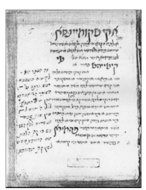
Figure 1 : "The book on how to make colours", MS Parma 1959, courtesy of L. U. Afonso.