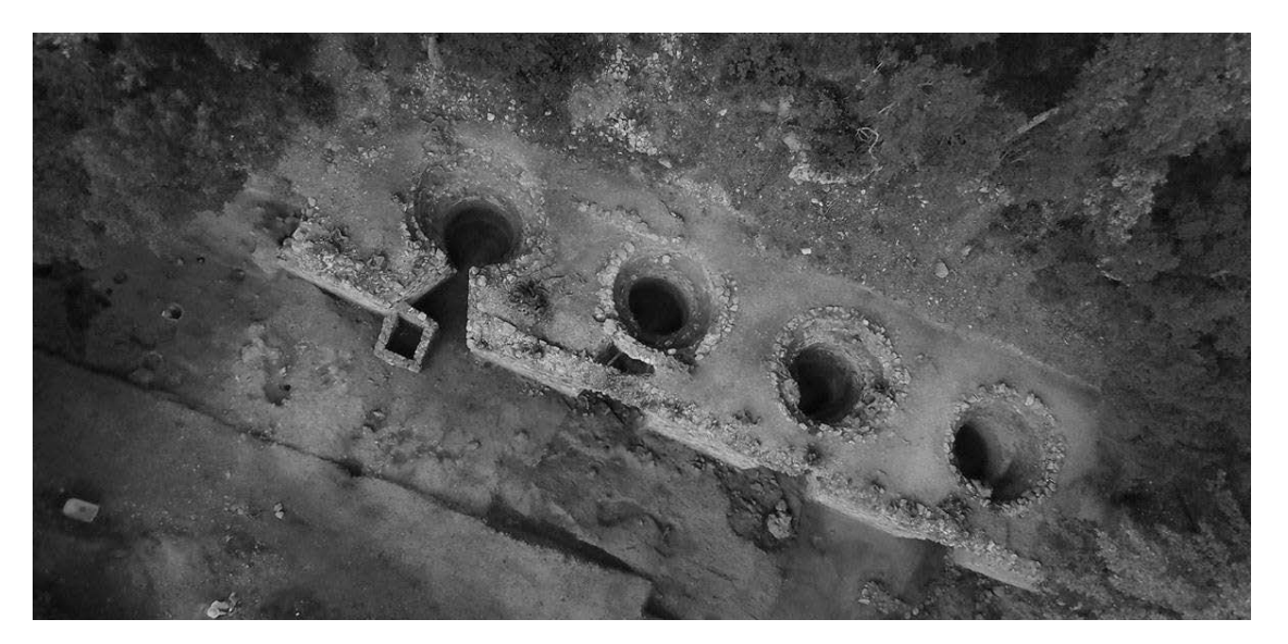
Fig. Monteleo alum fournaces

Ongoing researches carried out in southern Tuscany and northern Latium, a productive district which became crucial by the half of the XVth century, are providing new interesting evidences on alum exploitation, both on a documentary and technical point of view. In southern Tuscany in particular, the archaeological excavation of the so called "Allumiera di Monteleo", carried out by the University of Siena, is providing new important information on adopted technologies; the project is highly multidisciplinary and allows the full integration of historical documents and archaeology for a more complete understanding of preserved material evidence.