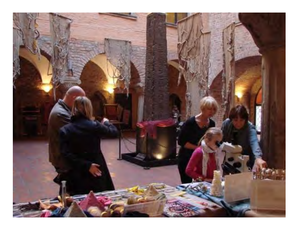
Fig.1 Exhibition of linen 3D fabrics and presentations of natural dyestuffs from the collection of Natural Dyeing Laboratory INF&MP in Archaeological Museum , Poznan, 2012

These works have led to participation in numerous interactive events, exhibitions in museums and workshops, Fairs, Festivals of Art and Science, designed for various social groups including designers, students and children.